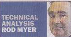
TECHNICAL ANALYSIS ROD MYER

MENTION precious metals and people's minds go immediately to gold. But platinum is even more valuable, due to decorative and industrial usage. Platinum is so rare that total world production to date would fit inside an average living room.