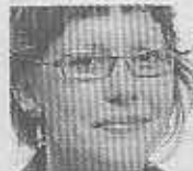
TECHNICAL ANALYSIS LUCY BATTERSBY

SHARES in ANZ are showing what technical analysts call "bullish divergence" between a chart of the daily closing price and a technical indicator based on the number of shares traded each day.